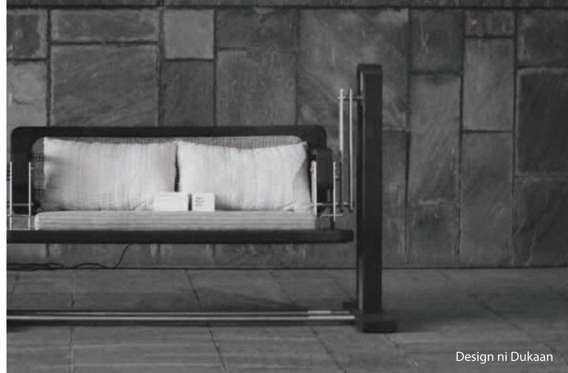
Design ni Dukaan