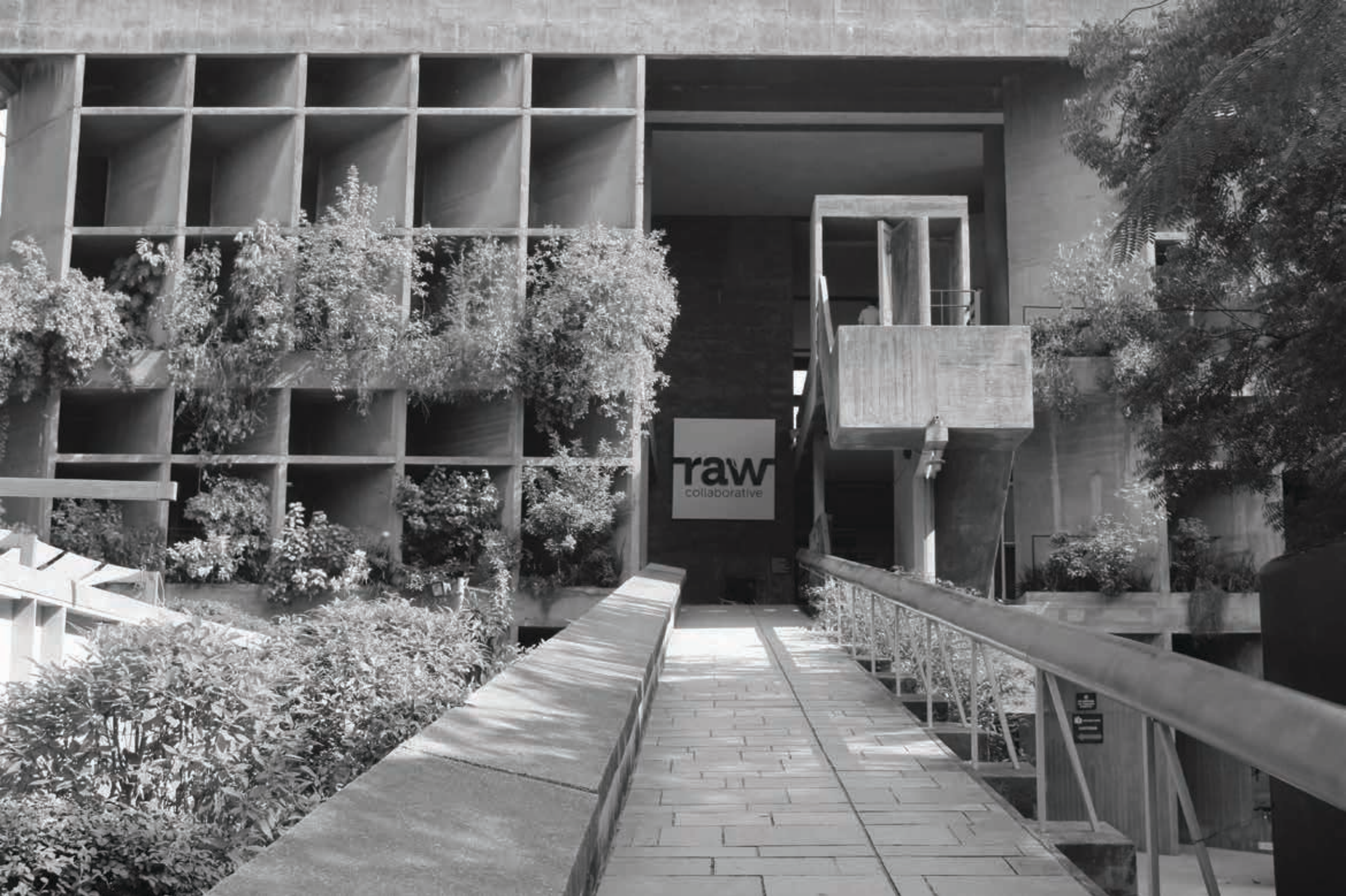
Mill Owners' Association Building, Ashram Road, Ahmedabad

+91 99250 00442 info@rawcollaborative.com rawcollaborative.com @ raw_collaborative f raw collaborative